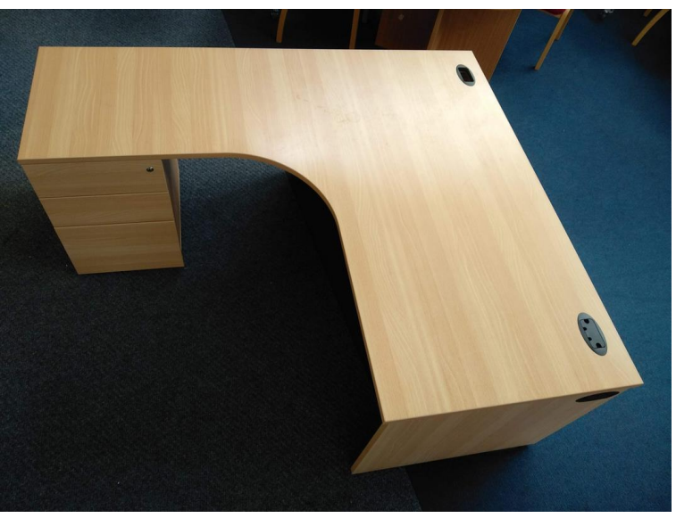
2 desks as above. One has a drawer unit The other one doesn't. Great condition!