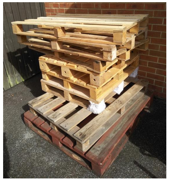
Pallets – good for fire wood!

Must be collected by Friday please. Speak to the office to find out more.